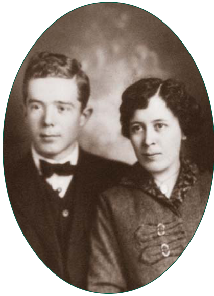
Above: This is an early portrait of Huey Long and his wife Rose. Rose completed his U.S. Senate term.

the community. Long's brothers and sisters resented his later claims of a poor, deprived childhood, which they considered lies to get votes.